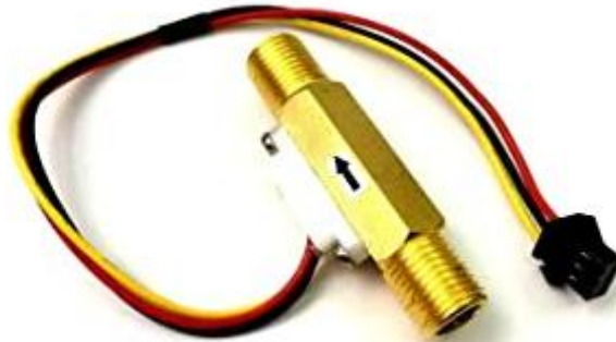
Fig 1:- Water flow sensor

Water Flow Sensors (0.25 inch and 0.75 inch dia) :- They are used for measuring various ranges of flow. For example the range of flow of 0.25 inch dia water flow sensor is 0.35 liter/min to 3 liter per minute whereas the flow range for 0.75 inch dia water flow sensor is 4 liter/min to 45 liter per minute as shown in fig 1.