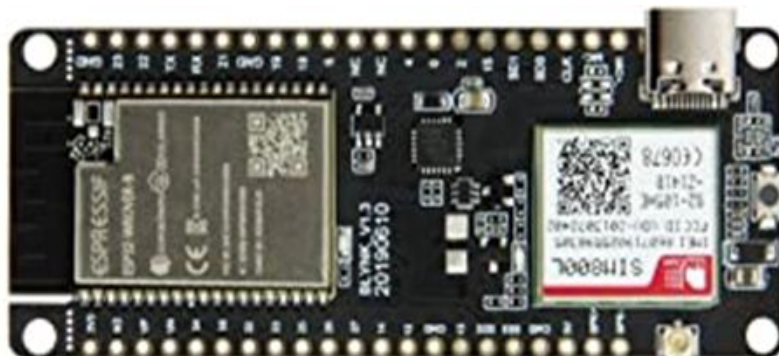
Fig 2:-TT-Go Module

TT-Go Module This module has a microcontroller along with GSM module. The microcontroller helps in calculation of flow by the process of quantization and sampling where as the GSM helps in data transfer or connection through server, It also give unique identity number to the device as shown in fig 2.