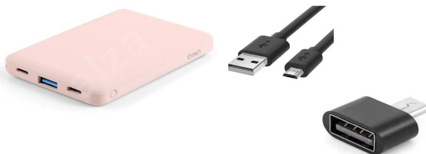
Fig 4:-Power bank and Data cable

Connecting cables: - They are used for transfer of data or power supply. They are also known as data cables as shown in fig 4