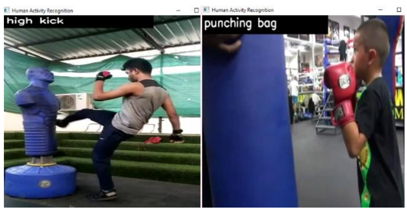
Fig.4: Output 3