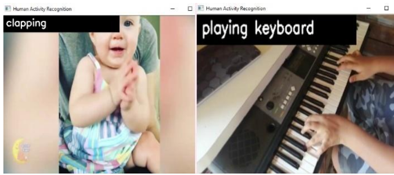
Fig.2: Output 1

The project has been tested on 30 videos with a range of 200-1800 frames. According to visual analysis, labelling (HAR) seems to have accuracy of 80%. The below images show the result of project with some of the recognised actions.