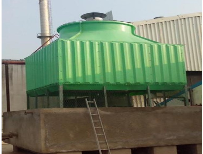
Figure 1.2 – Fluidized bed cooling tower