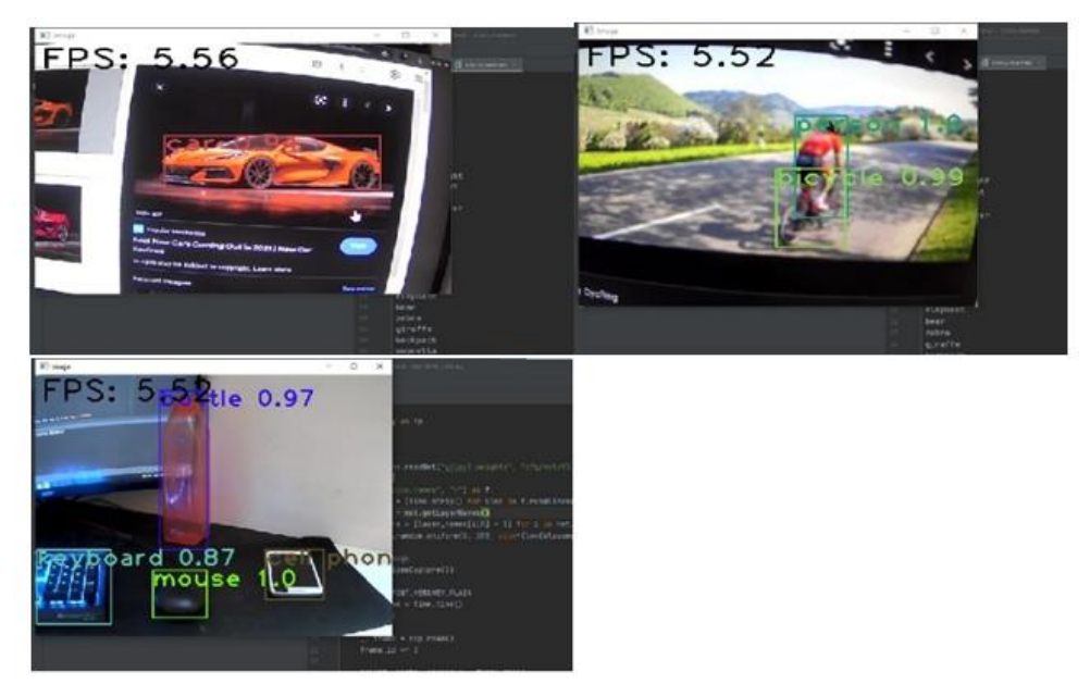
Fig 4 .FPS and Confidence in Different Blob Size at 320*320 from Experiment

of the algorithm produced at about 30 fps. But the accuracy was low and the camera and object had to be stabilized to get the best performance of the system.