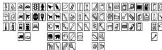
Fig.3. Objects in COCO model

Tensor Flow Object Detection API The TensorFlow API is widely used in the field of object detection. It is an open source software library for numerical computation using data flow graphs [8]. Second generation of Google artificial intelligence learning system got much attention and affirmation in the field of machine learning all over the world [2]. The API is trained by using the COCO dataset (Common Objects in Context). This is a dataset which contains 300k images of 90 most commonly found objects. Examples of objects includes: