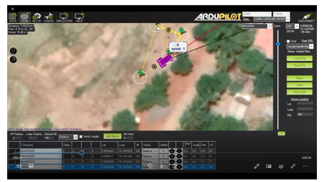
Figure 3: Mission Planner Software(Ground Station)