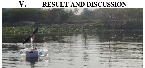
Figure 2: Autonomous Boat