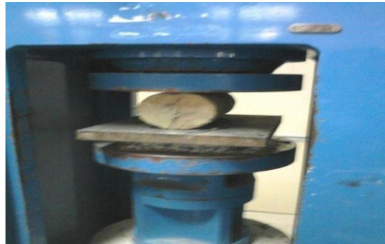
Fig 3.3 Cylindrical specimen under testing

This test is carried out by placing cylindrical specimens (150 mm diameter and 300 mm height) horizontally between the loading surfaces of a compression testing machine and the load applied until failure of the cylinder, along the vertical diameter.