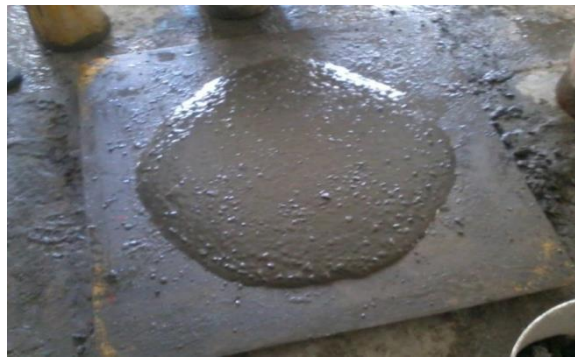
Fig. 2.1 Flow test

Slump test is the most commonly used method of measuring workability of concrete. The apparatus for conduction the slump test consists of a metallic mould in the form of a frustum of a cone.