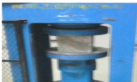
Fig. 3.1 Cube specimen under testing

The compression test is used to determine the hardness of cubical specimens of size 150mmx150mmx150mm. It was tested by using Compression Test Machine (CTM).