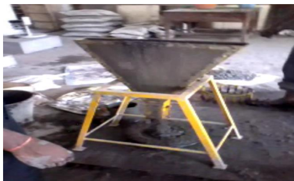
Fig. 2.3 V-Funnel test