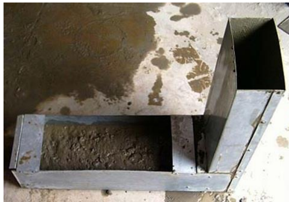
Fig. 2.2 L-Box test

This test is based on a Japanese design for underwater concrete, has been described by Peterson. The test assesses the flow of the concrete and also the extent to which it is subjected to blocking by reinforcement.