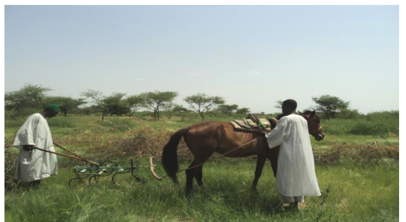
Plate (4) the draft animal with two labour and the cultivator