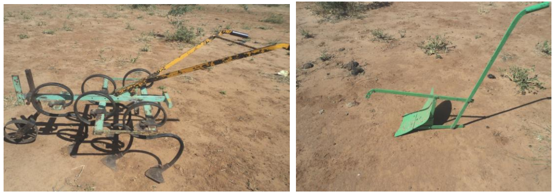
Plate (1) Plough (cultivator)

The modified Nubian plough (cultivator) is an animal drawn plough used for land preparation, land cultivation land reclamation with the specifications of weight 30 kg, width 80 cm. and set on one front wheel and has five flexible springs to minimize the impact of the collision with solid objects and five blades on three rows fixed on the main shaft of the plough. The tines are adjustable horizontally and vertically. Two of the tines are on the back and middle rows while one is in the front row (Plate 1). The digging machine (plate 2) composed of moldboard blade, hand and connecting fount shaft used for connecting the implement to the plough. It's also can be draft alone but this will add addition cost.