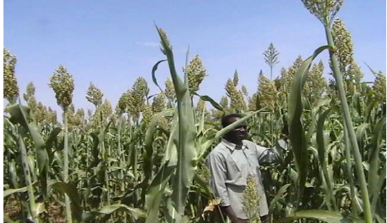
Plate (5) Sorghum plant height.

The plant samples were selected in each site by using steel frame (1x1 m). The plants in the one-meter square were measured once at harvesting and the measurement made from the ground surface to the tip of the plant using measuring tape of 5m (Plate 5). The records are average of three randomly selected area plants and measurements for all treatments, as described by [24].