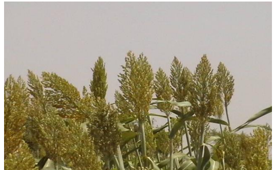
Plate (6) Sorghum (grain) seeds.