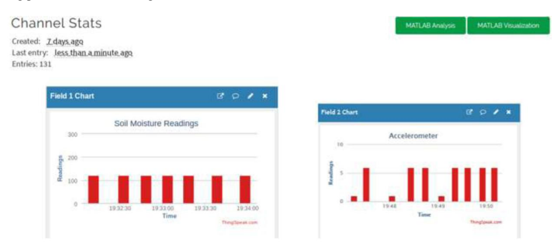
Figure shows the graphical representation of sensed values from soil moisture sensor and accelerometer which are uploaded on ThingSpeak cloud.

The value mapped consists of instrumental intensity, acceleration, velocity, perceived shaking and potential damage columns. If the shaking ismore, acceleration will be more and thus can cause heavy damage. All the output values of accelerometer are mapped according to acceleration column and corresponding intensity is being published to monitoring station.