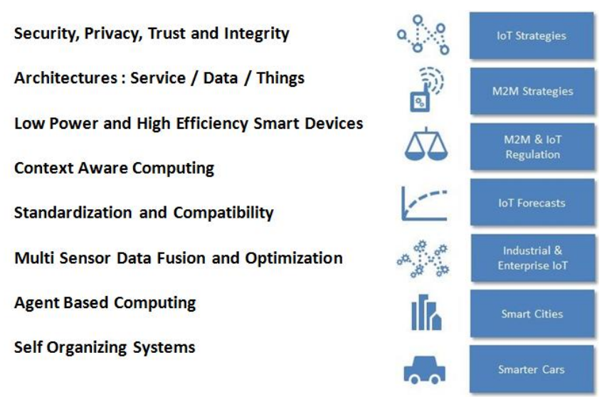
Figure 1.4 : Application Domains

The applications domains and IoT deployment viewpoints are as follows:-