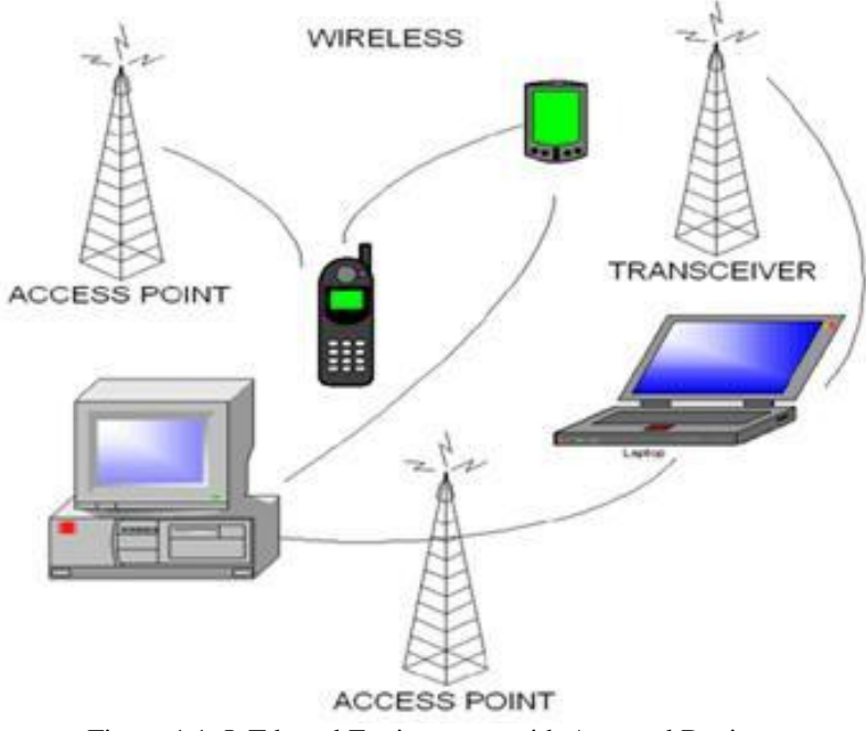
Figure 1.1: IoT based Environment with Assorted Devices

At the base level, IoT uses sensors and embedded chips that are inserted into the system we wish to monitor and track. Classically, RFID (Radio Frequency Identification) based devices are used to implement IoT. The Things, in IoT, refer to a wide variety of devices such as heart monitoring implants, remote monitoring and prescription biochip transponders deployed with patients, animals, electrical clams in coastal waters, automobiles with built-in sensors, or field operating devices that assist firefighters in search and rescue. Current market examples include smart thermostat and washer systems or dryers which use Wi-Fi for remote monitoring.