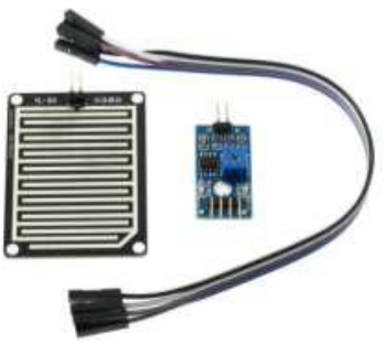
Fig 1: Rain sensor

The rain sensor is equipped with digital analogue pins through which the humidity can be sensed. When the sensed humidity is more than the threshold limit, then the desired action is performed (Reddy et al., 2018). When there is no raindrop on board. Resistance is high so we get high voltage according to Ohm's law V = IR. When raindrop present, it reduces the resistance because water is a conductor of electricity and the presence of water connects nickel lines in parallel so reduced resistance and the reduced voltage drop across it.