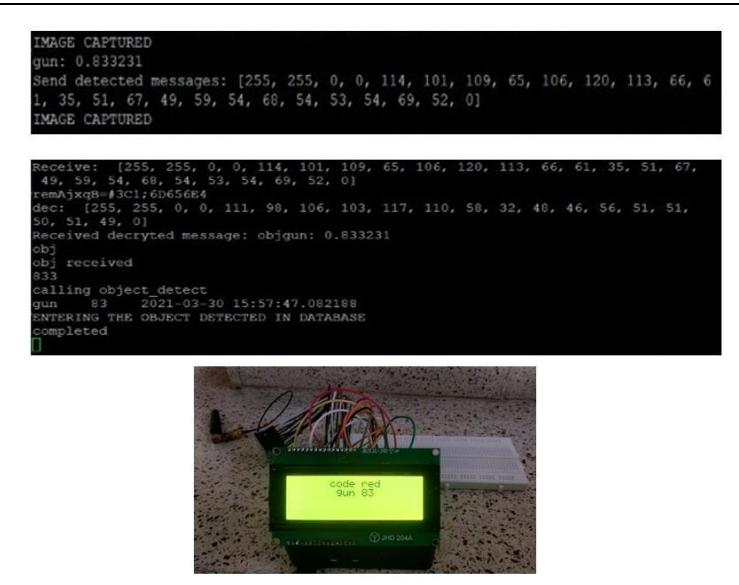
Figure4 (a): transmitter, 4 (b): receiver 4 (c): output in lcd