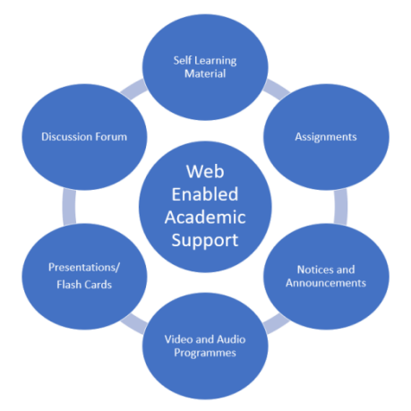
Fig. 1: Web Enabled Support System

National Centre for Innovations in Distance Education (NCIDE) was already supporting some programmes through Web Enabled Academic Support (WEAS). The WEAS platform provided self learning material, assignments which are an important part of continuous assessment in IGNOU evaluation system, supporting videos, a discussion forum and important notifications related to examination, forthcoming online counselling sessions and assignments to the learners. The list of features of the WEAS portal is shown in Fig. 1.