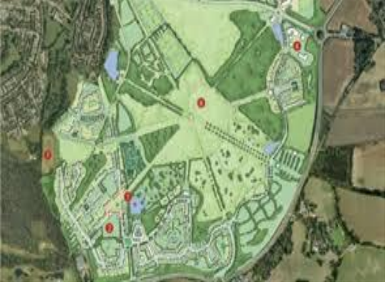
Welwyn Garden City

Welwyn Garden City was the second garden city in England (founded 1920) and one of the first new towns (designated 1948). It is unique in being both a garden city and a new town and exemplifies the physical, social and cultural planning ideals of the periods in which it was built. Welwyn, the second Garden City, 20 miles from London, performed just as well as Letchworth, but it lacked public, commercial and industrial buildings, which caused it to depend heavily on London for socio-economic activities.