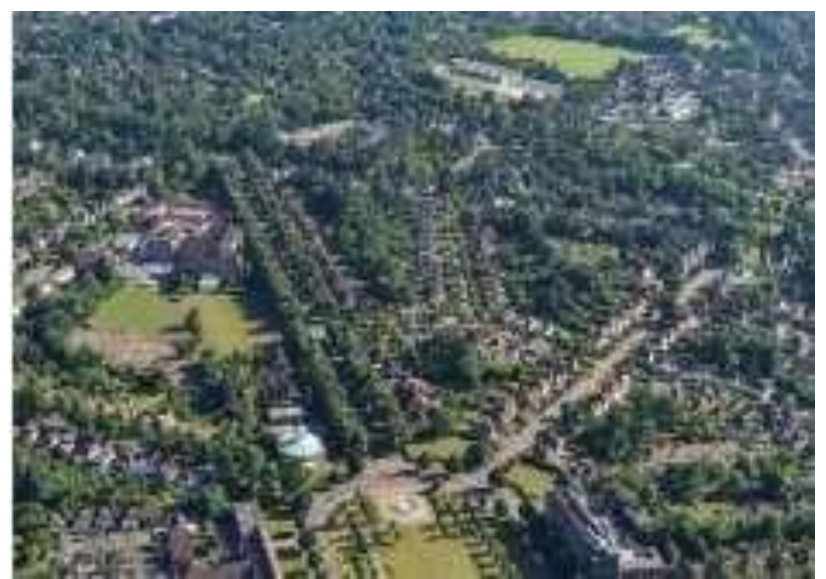
Letchworth Garden City

Howards Garden city model was directly experimented on two towns; Letchworth and Welwyn Garden City. Letchworth was the first Garden City ever built (Ebenezer Howard, 2014). It lies on a train line, 35 miles from London, located in Hertfordshire, England, and it covers an area of 5,500 acres, which used to serve as agricultural land with little or no value (Ebenezer Howard, 2014). Although Letchworth was not designed in a regular concentric pattern, it follows the zoning principles of the Garden City Model. In other to build Letchworth, Howard needed funding, but he did not get any financial support from the government. I suppose it was because the development of his ideal city had no positive effect on the pre-existing cities, which have been invested heavily upon. The idea of destroying or ignoring pre-existing cities to rebuilt perfect ones was also the basis of many other revolutionists in solving the industrial crisis. This approach displays the lack of consideration of the financial requirements in the realization of ideal cities. According to Autopodia (2014), Howard got financial support only from private investors who were concerned with their personal profits, rather than the communal growth of Letchworth City. As a result, Howard forwent the idea of communal land ownership with no landlords (Autopodia, 2014).