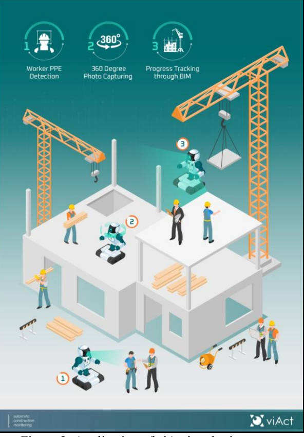
Figure 2: Application of viAct's robotic system

viAct's wheel based robotic system is an add-on to the existing application of viAct's smart monitoring system (Fig 2).