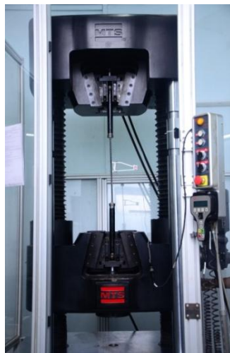
Fig.4. Tensile test setup

Where F_{tu} is ultimate tensile strength (MPa), P_{max} is the maximum force prior to failure(N), A is the cross-sectional area of the bar( mm^2 ). E -elastic modulus (MPa); P_1 - 50% maximum load(N) ; P_2 -20% maximum load(N) and \epsilon_1 the strain corresponding to 50% of the maximum load; \epsilon_2 the strain corresponding to 20% of the maximum load.