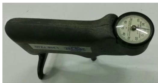
Fig.2 Barcol Impressor

Where HBa- Barcol hardness value,h - Indentation depth (mm),0.0076 - Indentation depth for one unit of barcol hardness.