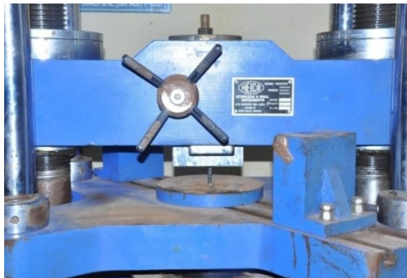
Fig.5. Compression test setup

1.3mm per minute till the specimen fails and the failure load was noted from the computerized data acquisition system. Figure 7 shows the typical test setup for compression. The compressive strength of the BFRP bar was calculated as P_{max}/A , where P_{max} is Maximum applied force (N), A is the cross-sectional area of the bar ( mm^2 ).