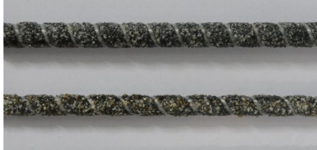
Fig. 1 Sand-coated BFRP bars

The sand coated BFRP bars of 8mm and 10mm- diameters supplied by Nickunj eximp enterprises private limited were used in current study. These BFRP bars were manufactured by pultrusion process, then the bars were applied with standard epoxy resin and braided with nylon wire, after that the quartz sand was coated on the bars as shown in Figure1.