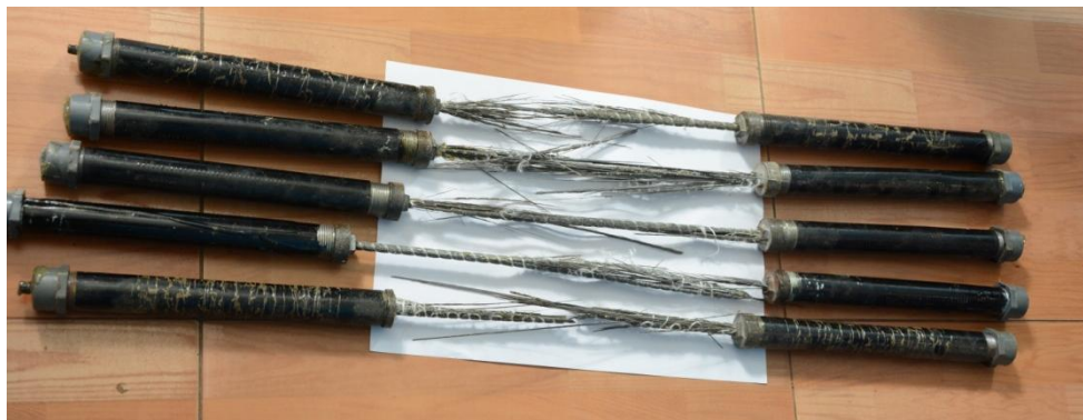
Fig.6. Failure of tensile specimens

The experimental tensile test results of BFRP bars were shown in Table 2. All BFRP bar specimens were failed in the gauge length due to rupture of fibres as shown in Figure 6. According to the tensile test results, the ultimate tensile strength and modulus of elasticity of the BFRP bars with a diameter of 10mm is slightly higher than the ultimate tensile strength and modulus of elasticity of the BFRP bars with a diameter of 8mm.