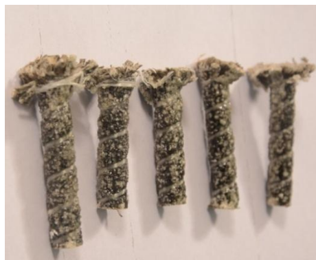
Fig.8. Typical failure mode

The peak compressive stress of tested BFRP bars was given in Table 2. Typical failure mode of the BFRP bars under compression as shown in Figure 8. It is observed that the failure of BFRP bars occurred due to crushing of longitudinal fibres. According to the compression test results, the ultimate compressive strength is three times lesser than the ultimate tensile strength of the BFRP bars. The ultimate compressive strength of the BFRP bars varies a smaller amount with the increase of diameter.