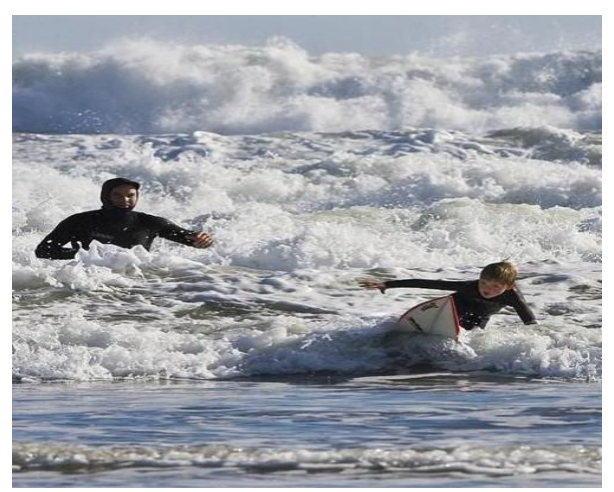
A couple of individuals riding waves on top of boards. Figure 1 An example of image captioning

Despite such challenges, the matter has achieved significant improvements over the past few years. Image captioning algorithms are typically divided into three categories, the primary category, as shown in Fig2. (a), tackles this problem using the retrieval-based methods, which first retrieves the closest matching images, then transfer their descriptions because the captions of the query