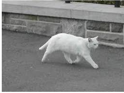
(Train image 2) Caption -> The white cat is walking on road (Train image 2) Caption -> The white cat is walking on road