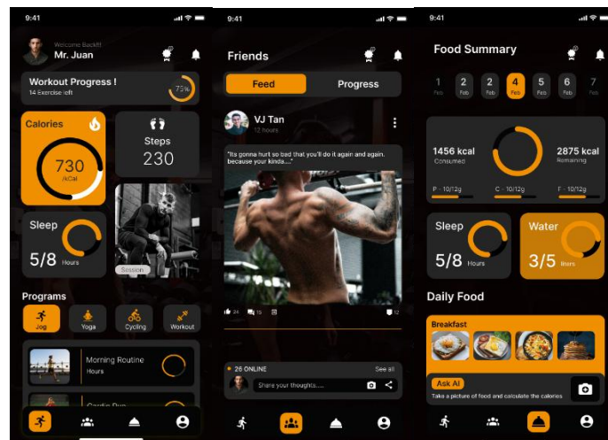
Figure 3. Shows the initial prototype model presented to the respondents.