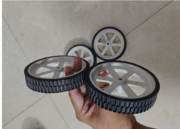
Fig: Rubber Visa Wheels