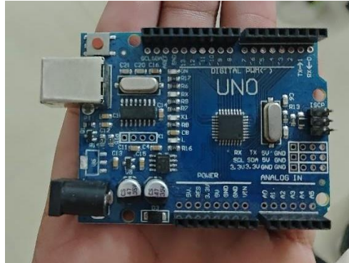
Fig: UNO R3 SMD BOARD ATMEGA328P

The "SMD" stands for surface-mount device, and the microcontroller (ATmega328p) is soldered directly to the board.