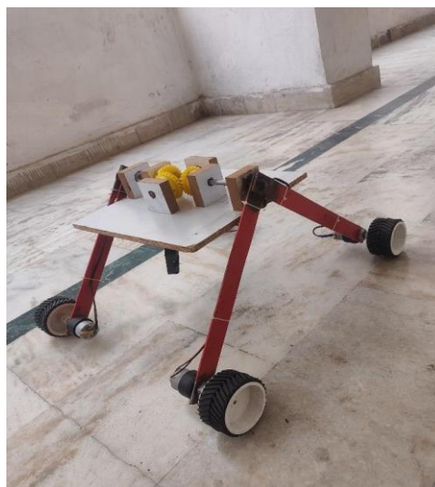
Fig. Project Final Image Side View ADVANTAGES