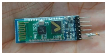
Fig: HC05 Bluetooth module

Wireless communication is swiftly replacing the wired connection when it comes to electronics and communication. Designed to replace cable connections HC-05 uses serial communication to communicate with the electronics. Usually, it is used to connect small devices like mobile phones using a short-range wireless connection to exchange files. It uses the 2.45GHz frequency band. The transfer rate of the data can vary up to 1Mbps and is in range of 10 meters. The HC-05 module can be operated within 4-6V of power supply. It supports baud rate of 9600, 19200, 38400, 57600, etc. Most importantly it can be operated in Master-Slave mode which means it will neither send or receive data from external sources.