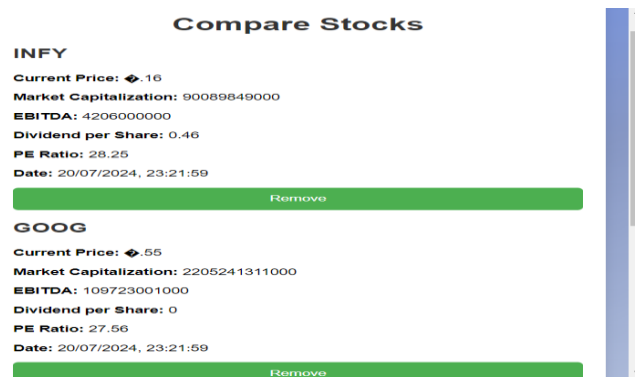
Fig 1.3: Comparison

Figure 1.3 depicts Compare Stocks interface of the stock market extension. It is provided in comparing several stocks side-by-side along with their key financial information. In the given example, all stocks added into the comparison list appear in the Compare Stocks interface along with the Current Price, Market Capitalization, EBITDA, Dividend per Share, PE Ratio and Date at which the data was retrieved. This interface can be used to remove stocks from the compare list by simply clicking the "Remove" button.