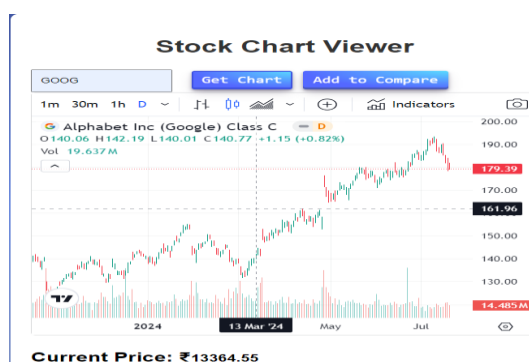
Fig 1.2: Result

Experimental results confirm the successful delivery of developed Stock Flash Extension in delivering correct real-time information on the stock market, interactively effective charting, and reliable performance. This points to the integration of the Alpha Vantage API and TradingView widgets backing up the extension in improving user experience and facilitating informed investment decisions.