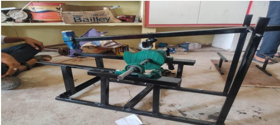
Figure 1: Cam Mechanism Hammering Machine

The Cam Operated Manual Hammering Machine is used in forging of light to medium jobs. The purpose of the machine is to provide a solution for forging workers to make forging convenient, less burdensome and superior. Currently this industrialization and the rapid growth in it have allowed the rich and wealthy producers to get ahead but the local level blacksmiths are highly affected by this growth. It also helps in reducing heating cycles since it completes the forging of given object in less time than by regular method of hand forging to boost their production and improve the quality of the forged components. The machine consists of a cam so designed to provide impact motion at regular intervals. A chain & sprocket is attached to cam and the cam is rotated using legs like one does cycling. This imparts rotary motion to cam and hammer moves up and down. The speed of the impact cycles can be easily controlled by controlling speed of pedaling.