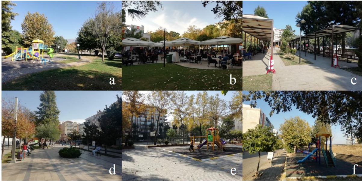
Figure 2: Aydın's dirtiest [NevzatBiçer park (a), Adnan Menderes park (b), ŞehitNedip Cengiz Eker park (c)] and the cleanest [Tataristan-Bugulmaparkı (d), YediEylülparkı(e), Ahmet EminArkayınparkı (f)] parks.

are cleaned during the day (Figure 2). The fact that Sunday ranks first and third among the days with the highest average litter number in all parks in the city of Aydın (first with 12.10 pieces of litter on 16.01.2022, third with 10.77 pieces of litter on 09.01.2022), demonstrates that the parks are used intensely on Sunday.