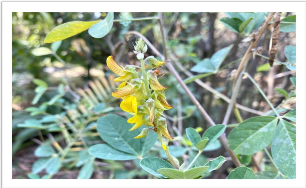
Photograph: Crotalaria pallida with flower