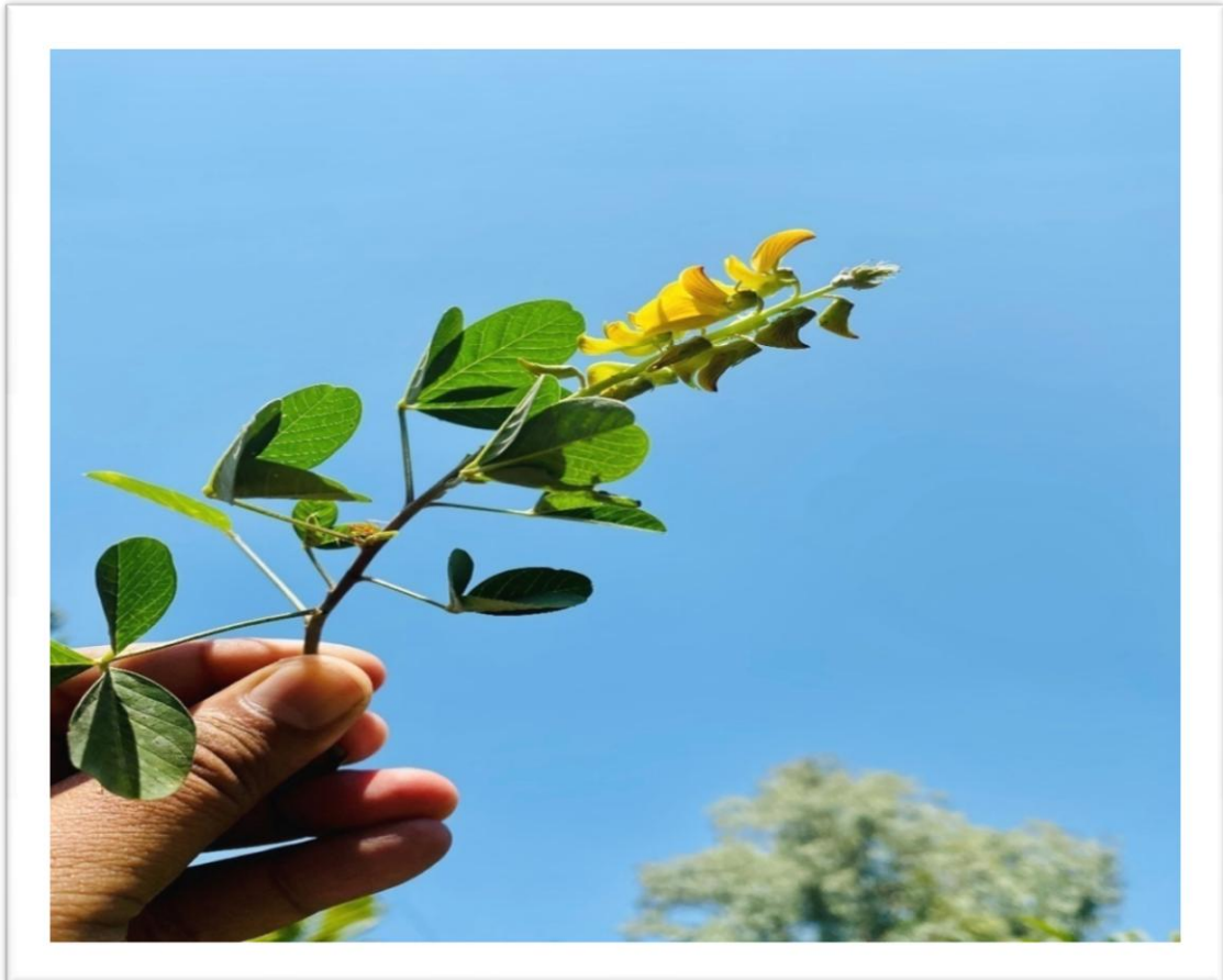
Photograph: Crotalaria pallida with flower