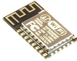
Fig. 6. ESP-12E-WIFI Module

ESP-12E is a miniature Wi-Fi module present in the market and is used for establishing a wireless network connection for microcontroller or processor