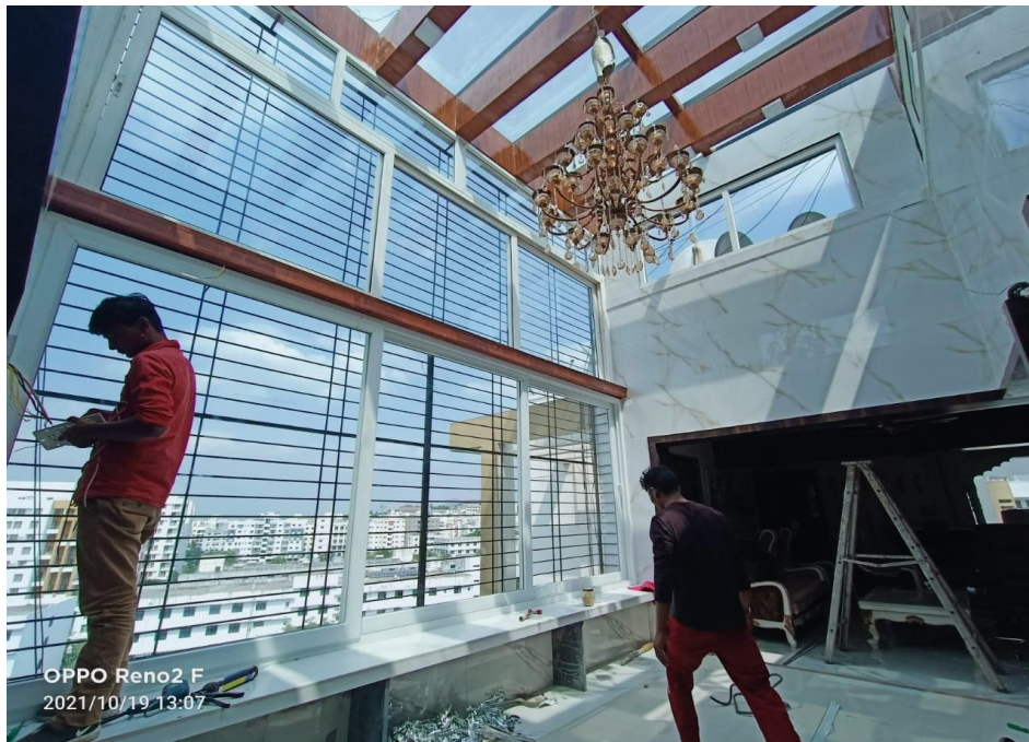
Fig-4.2 Installation of UPVC Windows.

UPVC windows are cost effective compared to other wooden windows. Apart from this, UPVC windows are highly durable and possess multipurpose functionalities.