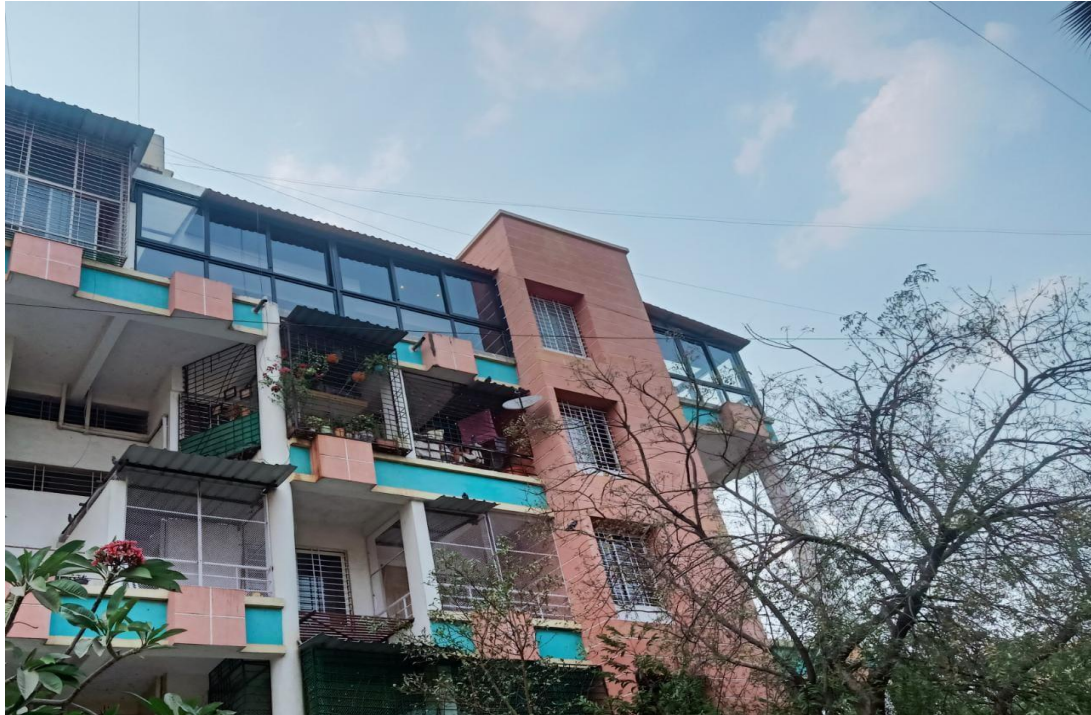
Fig 4.4 Acoustic View of a residential building after installing UPVC Windows.