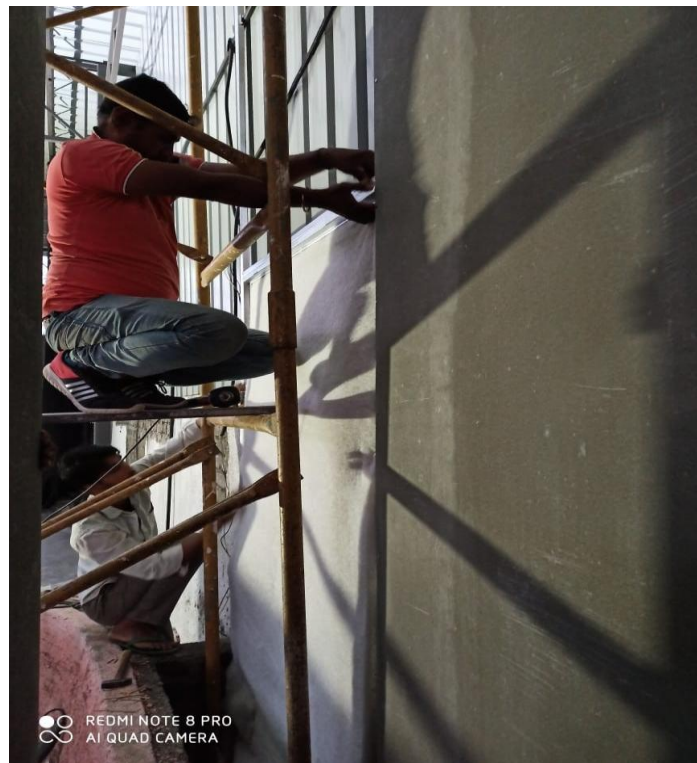
Fig-4.2 Installation of Acoustic Foam on the walls.

With sound absorption, the sounds are absorbed by the material, reducing background sounds and reverberation. These materials tend to be light and porous, which is necessary for absorbing sounds.