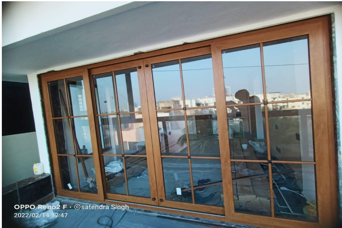
Fig-4.2 After installing UPVC Windows.