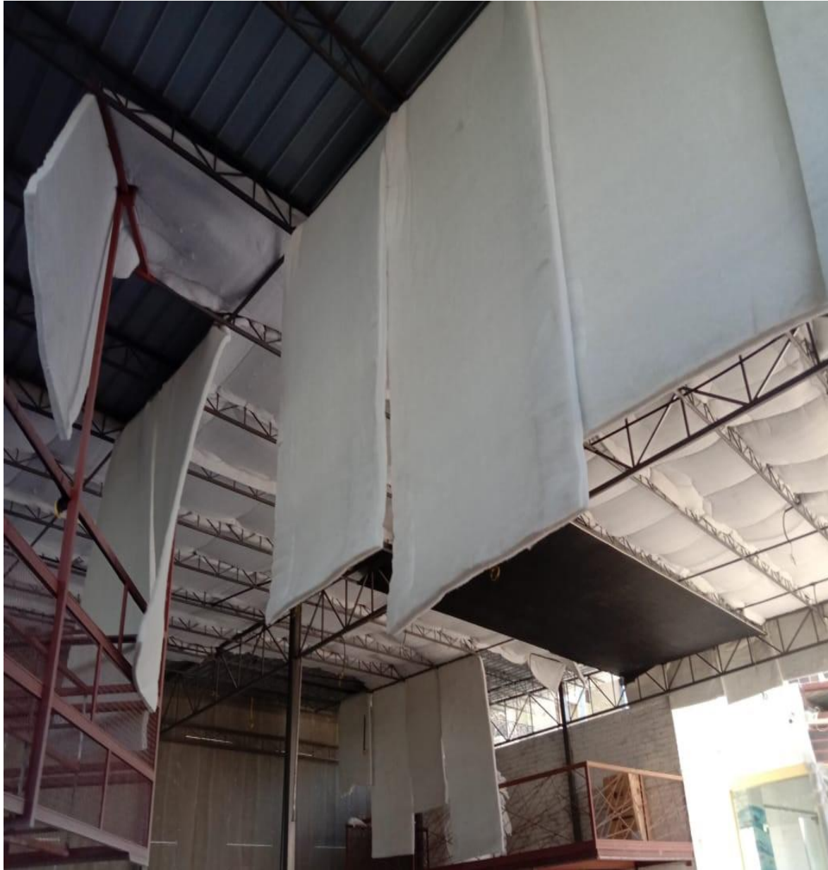
Fig-4.2 Installation of Acoustic Foam on the roof.