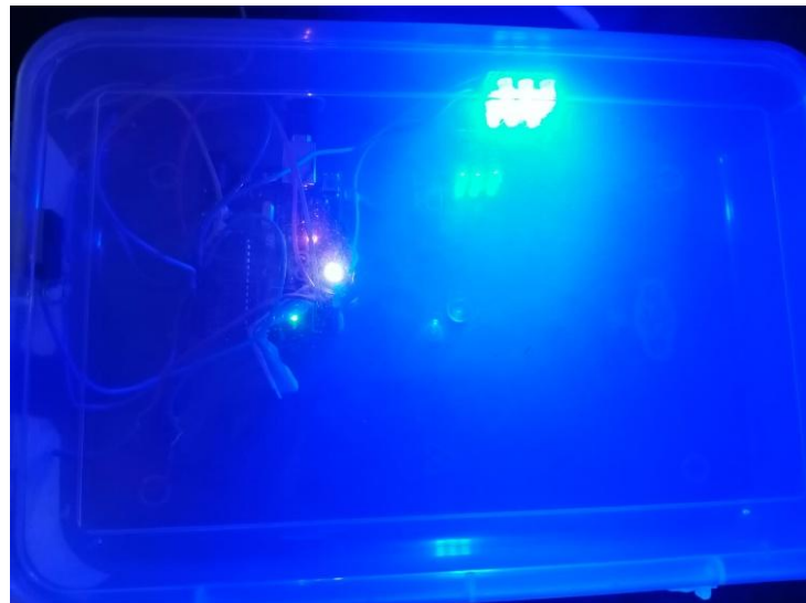
Fig 4: Disinfection Using UV-light