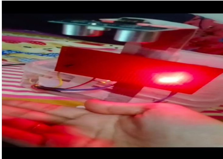
Fig.3: Hand sanitization Using Ultrasonic Sensor