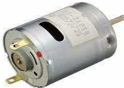
Fig 2.1.1: Electric DC motor

An Electric motor is an electrical device that converts electrical energy into mechanical energy. In normal motoring mode, most electric motors operate through the interaction between an electric motor's magnetic field and winding currents to generate force within the motor. Electric motors may be classified by electric power source type, internal construction, application, type of motion output, and so on.