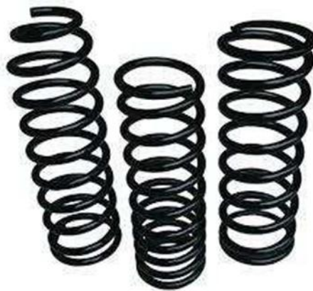
Fig 2.1.3: Spring

A coil spring, also known as a helical spring, is a mechanical device which is typically used to store energy and subsequently release it, to absorb shock, or to maintain a force between contacting surfaces. Two compression springs are used to push back the brake shoe back in its position.