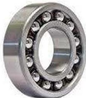
Fig 2.1.3(b): Bearing

The purpose of Ball Bearing is to reduce rotational friction and support radial and axial loads. In this project 608 2RS type of bearing is used.