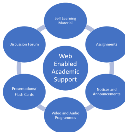
Fig. 1: Web Enabled Support System

National Centre for Innovations in Distance Education (NCIDE) was already supporting some programmes through Web Enabled Academic Support (WEAS). The WEAS platform provided self learning material, assignments which are an important part of continuous assessment in IGNOU evaluation system, supporting videos, a discussion forum and important notifications related to examination, forthcoming online counselling sessions and assignments to the learners. The list of features of the WEAS portal is shown in Fig. 1.