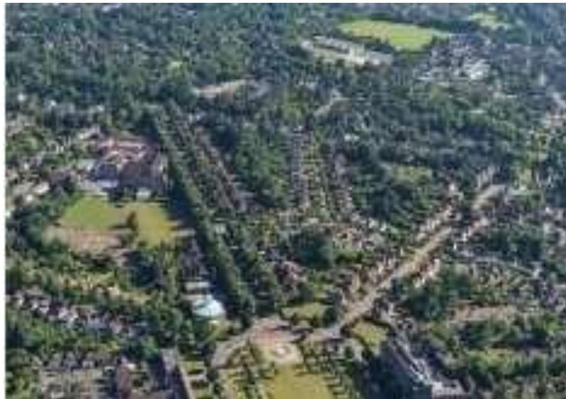
Letchworth Garden City (Source: Aerial photo of Letchworth garden city)

Howards Garden city model was directly experimented on two towns; Letchworth and Welwyn Garden City. Letchworth was the first Garden City ever built (Ebenezer Howard, 2014). It lies on a train line, 35 miles from London, located in Hertfordshire, England, and it covers an area of 5,500 acres, which used to serve as agricultural land with little or no value (Ebenezer Howard, 2014). Although Letchworth was not designed in a regular concentric pattern, it follows the zoning principles of the Garden City Model. In other to build Letchworth, Howard needed funding, but he did not get any financial support from the government. I suppose it was because the development of his ideal city had no positive effect on the pre-existing cities, which have been invested heavily upon. The idea of destroying or ignoring pre-existing cities to rebuilt perfect ones was also the basis of many other revolutionists in solving the industrial crisis. This approach displays the lack of consideration of the financial requirements in the realization of ideal cities. According to Autopodia (2014), Howard got financial support only from private investors who were concerned with their personal profits, rather than the communal growth of Letchworth City. As a result, Howard forwent the idea of communal land ownership with no landlords (Autopodia, 2014).