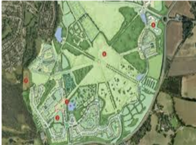
Welwyn Garden City (Source: Aerial photo of Welwyn garden city)

Welwyn Garden City was the second garden city in England (founded 1920) and one of the first new towns (designated 1948). It is unique in being both a garden city and a new town and exemplifies the physical, social and cultural planning ideals of the periods in which it was built. Welwyn, the second Garden City, 20 miles from London, performed just as well as Letchworth, but it lacked public, commercial and industrial buildings, which caused it to depend heavily on London for socio-economic activities.