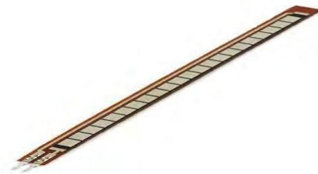
Figure 2: Flex Sensor

One of the most important components used on our device is the Flex Sensor. The angle of angle from the curve takes up the measurement when it bends. It is commonly used in areas such as robotics, gaming (virtual motion), medical devices, computer particulars, musical instruments, physical therapy, simple construction, and la profile. It has two types of shapes. One in 2.2 inches and the other is 4.5 inches. It has a temperature range of -35 ° C to + 80 ° C. Flat resistance is about 25K oz and resistant tolerance is about 30%. It is bend resistance range from 45K to 125K ohm (depending on the bend radius). The life cycle of these sensors is more than 1 million.