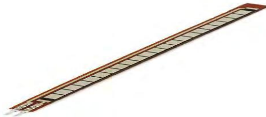
Fig.3. Flex Sensor

Flex sensor is one of the most important components used on our device for the measurement of angle when it bends. It is most commonly used in robotics, medical devices musical instruments, physical therapy, simple construction gaming etc. It is available in two different sizes one is 2.2 inches and other is 4.5 inches with a temperature range of -35 deg. Celsius to +80 deg. Celsius.