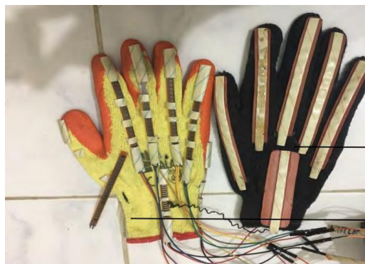
Fig.2 Old Gloves vs New Gloves