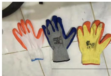
Fig.1 The range of gloves from where one is selected

Another notable change is that we remove 2.2-inch flex sensors from the wrist and added two 4.5 inch Flex sensors in those places. We have done so because FLEX sensors have a much better result when covering and categorizing more area.