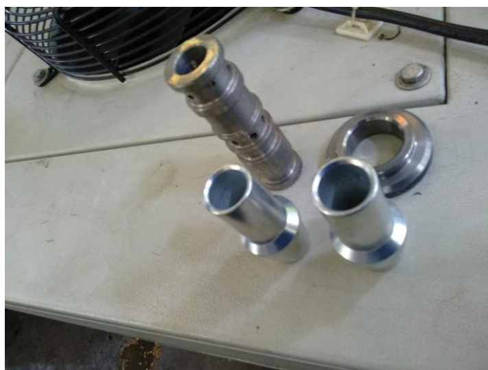
Cleaned Components Image 1.

contacting the surface with 10-15 ml/liter of a composition comprising in table 5, 2) maintaining contact to remove residue from the surface.