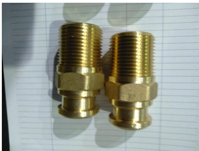
Cleaned Components Image 3.