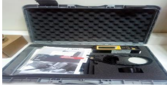
Fig. 2. Concrete Test Hammer Kit