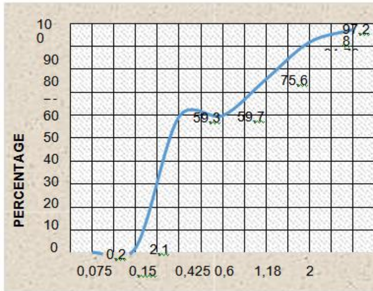
Fig. 8. Particle Size Graph on a Fine Sand