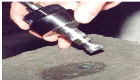
Fig. 6. The expansion unit inserted in the hole and capo-insert fully expanded to 25 mm diameter