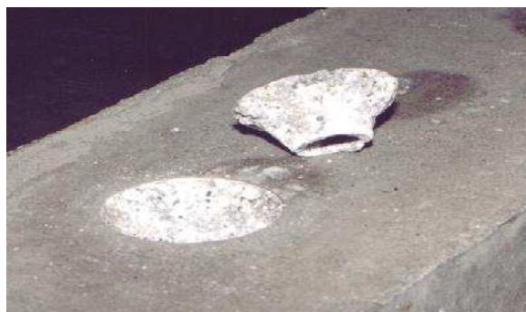
Fig. 7. Failure type observed for validation of result

A consensus has been achieved regarding the existence of a triaxial state of stress highly non uniform on the concrete involved the capo-insert during extraction [8-9].