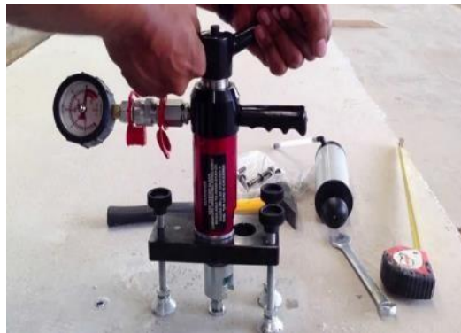
Fig. 3. Pullout tester

One of the techniques used for this purpose is the CAPO- TEST System developed by “Germann Instruments A/S” in 1962 [11]. In this technique the load is applied to the capo- insert by means of a hydraulic jack and a reaction ring of 55 mm inner diameter. The capo-insert (25 mm diameter ring) is laced at a depth of 25mm (Fig. 6 and Fig. 7). The pull-off tests enable the determination of direct tensile strength in- situ. The possibility of using this method with partial coring enables the measurement of such property at different depth. For this test method, recommendations are made [7].