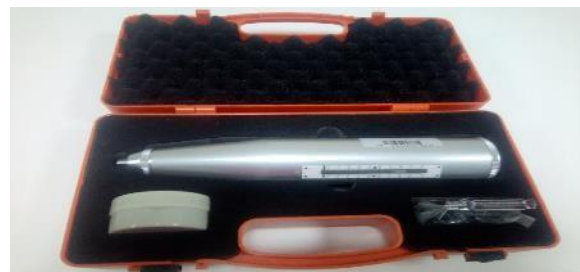
Fig. 1. Digital Concrete Hammer Kit

This may limit the use of the technique in some situations. Usually this method is recommended for elements of large surfaces like slabs or elements of large cross sections [4].