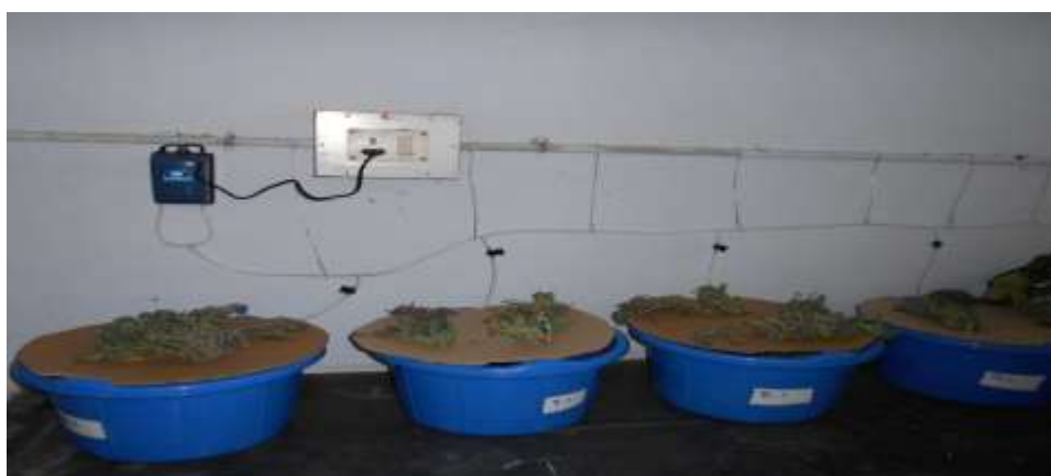
B. Heliotropium curassavicum L.