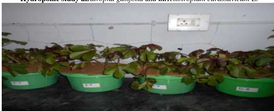
A. Jatropha gasifolia

Hydroponic study a. Jatropha gasifolia and b. Heliotropium curassavicum L.